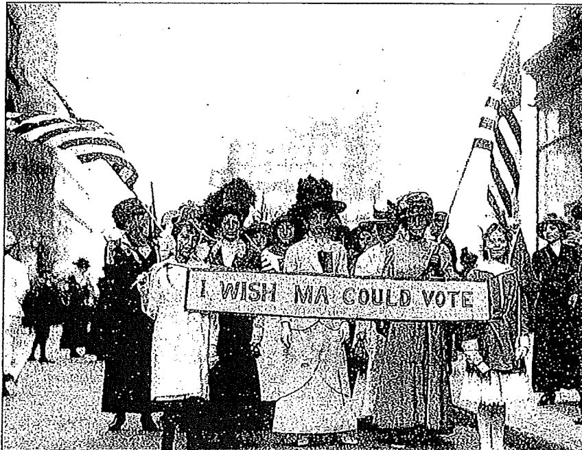
Suffragettes in New York

[In response, I said]: "Over one thousand women have gone to prison in the course of this agitation, have suffered their imprisonment, have come out of prison injured in health, weakened in body, but not in spirit. I come to stand my trial from the bedside of one of my daughters, who has come out of Holloway Prison, sent there for two months' hard labour for participating with four other people in breaking a small pane of glass. She has hunger-struck in prison. She submitted herself for more than five weeks, to the horrible ordeal of feeding by force, and she has come out of prison having lost nearly two stone [28 pounds] in weight. She is so weak that she cannot get out of her bed. And I say to you, gentlemen, that is the kind of punishment you are inflicting upon me or any other woman who may be brought before you. I ask you if you are prepared to send an incalculable number of women to prison—I speak to you as representing others in the same position—if you are prepared to go on doing that kind of thing indefinitely, because that is what is going to happen. There is absolutely no doubt about it. I think you have seen enough even in this present case to convince you that we are not women who are notoriety hunters. We could do that, heaven knows, much more cheaply if we sought it. We are women, rightly or wrongly, convinced that this is the only way in which we can win power to alter what for us are intolerable conditions, absolutely intolerable conditions. . . .